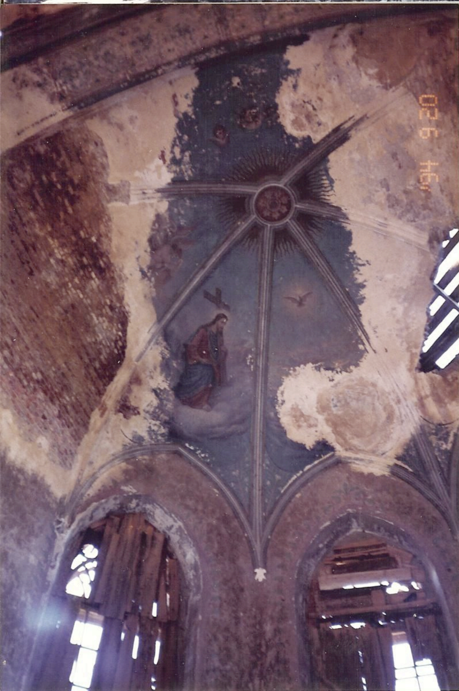
ST MARY'S CHURCH KAMENKA, RUSSIA 1994 AFTER COMMUNISTS USED IT FOR GRANERY. NOTE MOSIAC ON DOME AND CROSS ON STEEPLE THEY COULDN'T FIGURE HOW TO GET DOWN!!!